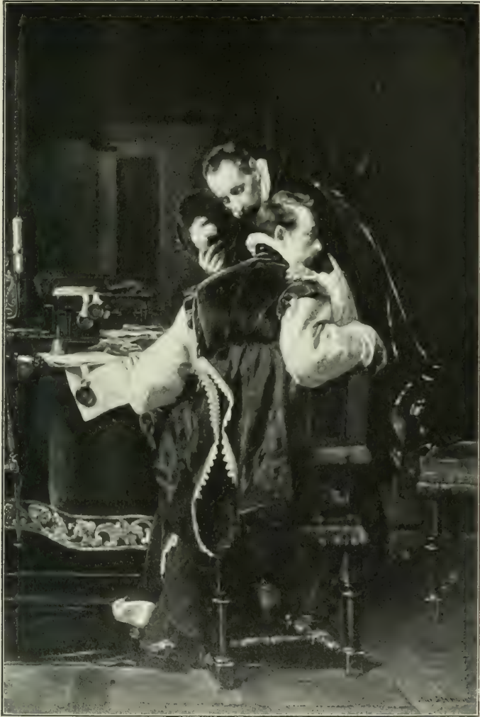
LAST INTERVIEW OF WILLIAM OF ORANGE AND COUNT ESMONT.